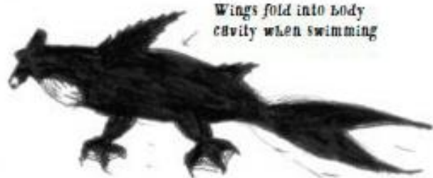
Wings fold into body cavity when swimming